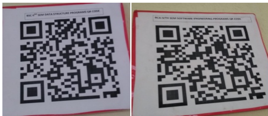
Bar code of different lab assignments